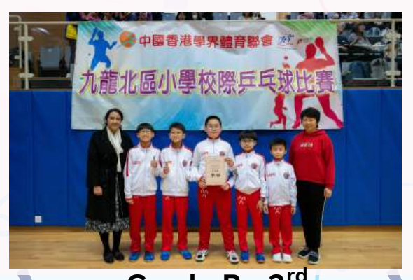
Grade B - 3<sup>rd</sup>