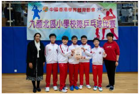
Grade A - 1st

The Table Tennis School Team participated in the Kowloon North Area Inter-Primary Schools Table Tennis Competition on 17<sup>th</sup> February.